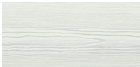
CEDAR MILL HARDIE PLANK ARCTIC WHITE