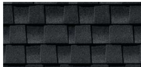
TIMBERLINE GAF SHINGLES CHARCOAL