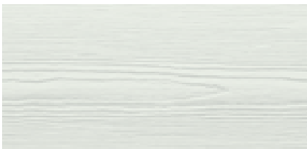
CEDAR MILL HARDIE PLANK ARCTIC WHITE